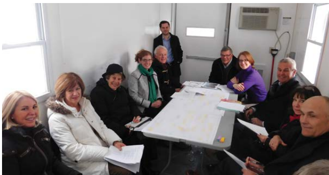
Safe Place Campaign Committee meets in the construction trailer to review plans.