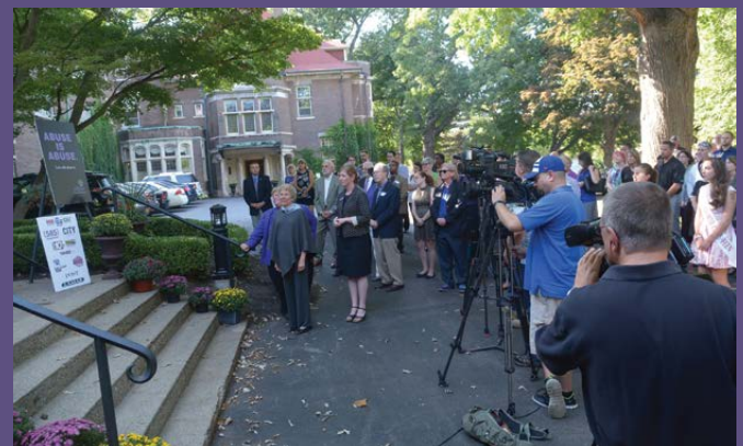
Crowd gathers to mark the historic moment.