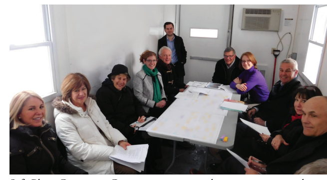
Safe Place Campaign Committee meets in the construction trailer to review plans.